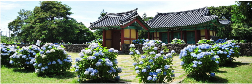
Honinji, where the three demigods got marriage (Jeju, Korea)