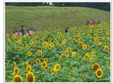
Historical site of the Anti-Yuan rebellion. (Jeju, Korea)

However, on the view of the Tamna, the rebels were invaders. There are legends that the leader of the rebel suppressed the Tamna people.