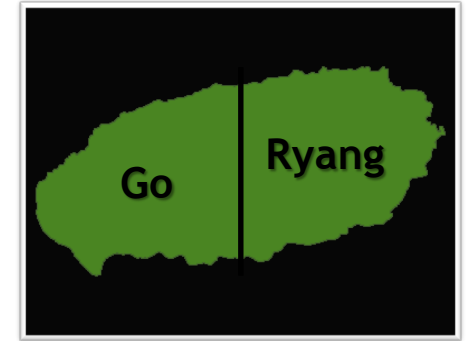
The picture that illustrates two leaders

They fought each other heavily. One result of the fight was loss of independence, and becoming a locally autonomous region administered in Goryeo.