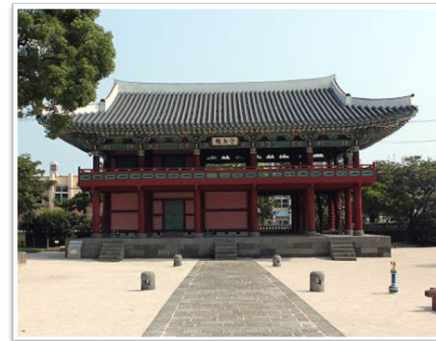
Office of the Jeju Governor of Joseon (14 th c., recovered 2002, Jeju, Korea)