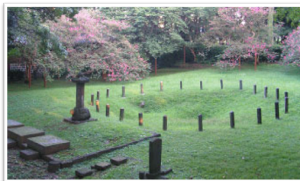
Samseonghyeol. (Jeju, Korea) Legend tells demigods emerged here.

Tamna ruled Jeju Island until the Joseon Dynasty claimed it in 1404. Before the Joseon rule, Tamna ruled Jeju as a tributary state or local autonomous administration under Baekje, Silla, Goryeo, and Yuan for a thousand years.